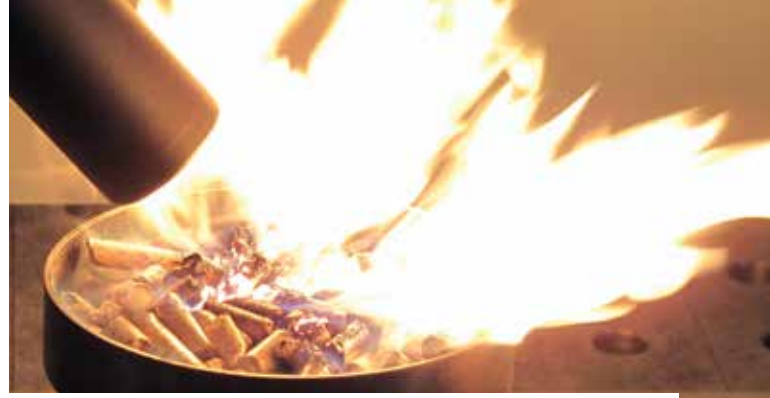
Clean ignition process due to optimum heat level.

housing. The freely configurable plug connector and the air hose connection adapter with one-inch inner thread are innovative measures ensuring optimum installation into heating boilers of all categories.