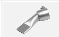
Wide slot nozzle 20 mm 130.631 124.772 (reinforced)