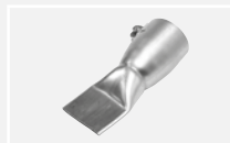
Wide slot nozzle 40 mm 130.891 124.777 (reinforced)