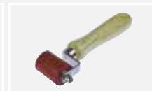
Pressure roller, silicone 130.611 40 mm 130.146 30 mm* * with ball bearing