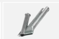
Speed welding nozzle Ø 4 mm 146.740