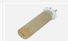
Heating element HT1600D 158.802 (230 V) 158.805 (120 V)