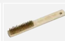
Brass brush 130.612