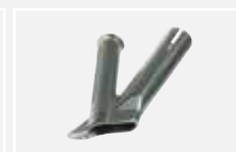
Speed welding nozzle Ø 5 mm 125.315