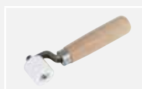
Pressure roller 30 mm, PTFE 131.693