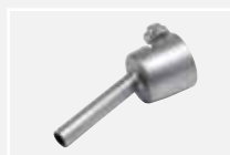
Tubular nozzle Ø 5 mm 130.632 147.250 (reinforced)