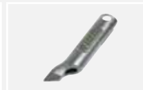
Tacking nozzle 147.248