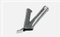
Speed welding nozzle Ø 7 mm, triangular profile 127.833