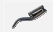
Swan neck nozzle 133.174